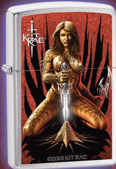
Model #24283 UPC #24283-1 Aluen Brushed Chrome

Enter a realm of dreams and nightmares, swords and sorcerers, where reality meets fantasy in a world defying conventional description.