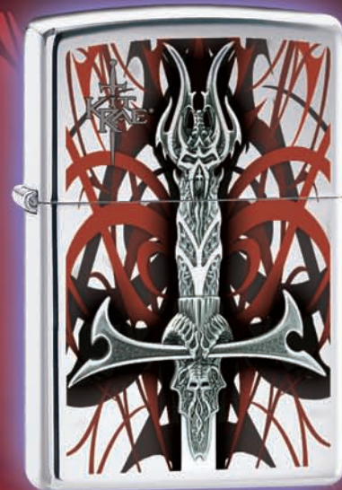
Model #24284 UPC #24284-8 Molotoch High Polish Chrome