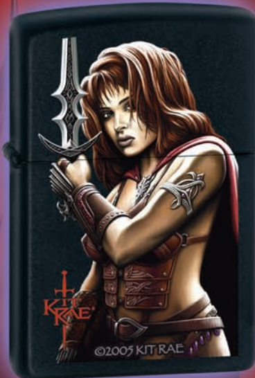
Model #24281 UPC #24281-7 Vaelen Black Matte

each lighter is sure to be cherished by collectors and fantasy enthusiasts the world over.