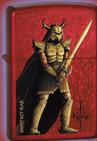
Model #24282 UPC #24282-4 The Dark One Candy Apple Red