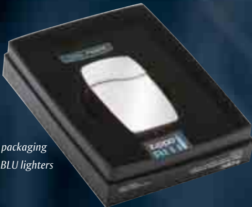
Standard packaging for Zippo BLU lighters

. . . and more! We are thrilled to unveil Zippo BLU™ in Zippo's most enduringly popular finish, brilliant high polish chrome.