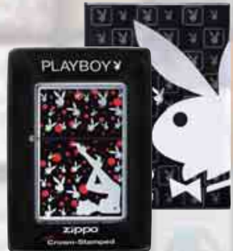
Packaging for the Playboy Crown-Stamped lighter

Available selected countries, some restrictions may apply.