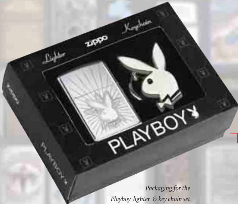
Packaging for the Playboy lighter & key chain set