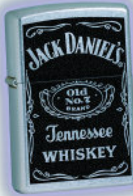
21043 Jack Daniels Label