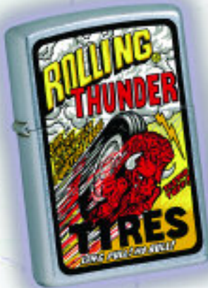
21013 Rolling Thunder