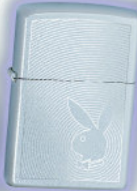
21031 Playboy Bunny Wave