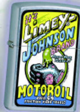
21011 Limey-Johnson Motor Oil