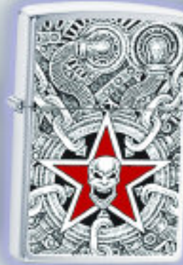
20412 Skull Industrial