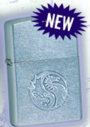
21035 Raised Dragon

Bold, bright, and bound to light up your sales! Turn Up the Heat II features 10 eyeball-popping designs with new manufacturing processes, and new licensed products!